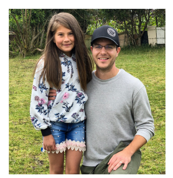
18 | Annual Report 2021 🎇

"Merry Christmas! I love you so much. Thank you so much for always being there for me. You really have been very helpful. I have no words to explain just how much your relationship means to me."