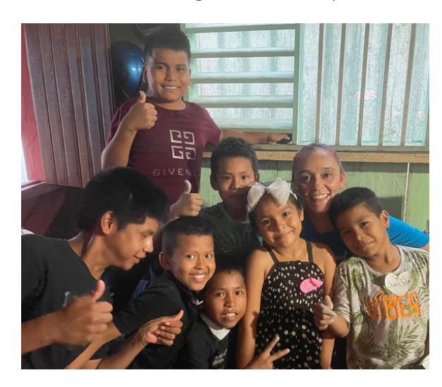
13 | Annual Report 2022 🍀

Our mission trips have brought much-needed aid to these communities and allowed our volunteers to gain a deeper understanding of global issues and develop their leadership skills. We are grateful for the dedication and passion of our volunteers, who continue to make a positive difference in the lives of those in need through our mission trips.