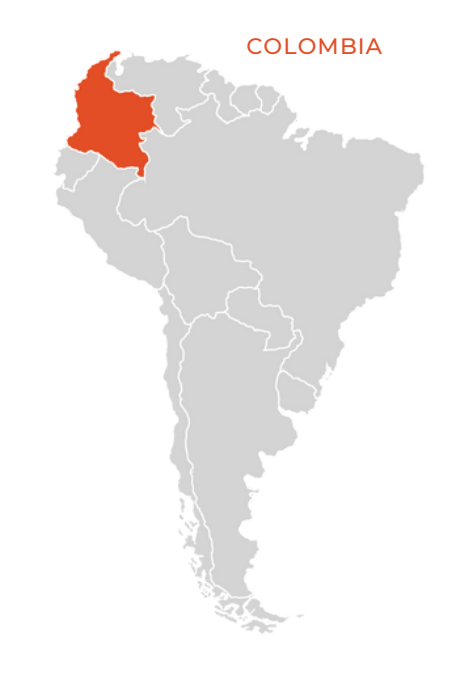
10 | Annual Report 2022 🎇