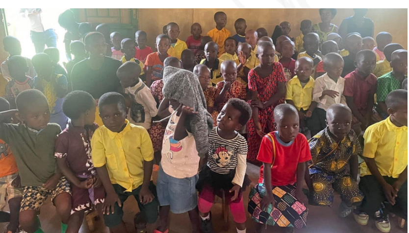
05 | Annual Report 2022 🎇

All of this, and more, will be provided in a comfortable and safe environment where strong relationships can be formed between children, parents, and educators.